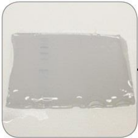
Run your protein gel with visible protein ladder standard.