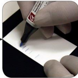
Annotate your blot. Mark the visible protein bands of the standard.