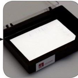
Perform standard Western blotting.